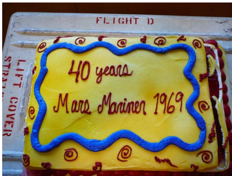
The 40-year reunion cake

Then we had cake and toasted ourselves and our project. It is only now that I realize that I didn't get any of the cake. No pizza and no cake? I really must have had too much wine. More seriously, we vowed that we would have reunions every five years now instead of ten, bowing to the limits of lifetime.