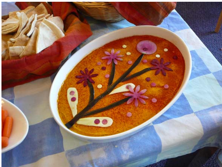
Hummus disguised as a flower painting

The IRS and Gas System were on display, and another highlight of the day was the movies, “The Martian Investigators” and “Mariner Mars 1969: A Space Oddity”. The former was a NASA documentary that focused on the conflict between our IRS team and the Cal Tech camera team. The latter was a silent 16mm film made by Don Renfro showing us in our youth zipping around Florida and viewing the night and day launches of Mariner 6 and 7 respectively.